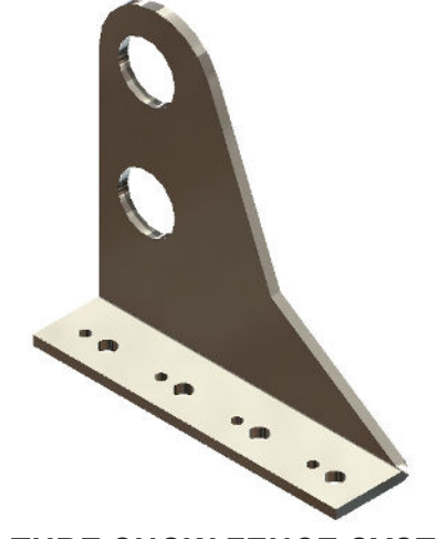
2 TUBE SNOW FENCE SYSTEM

USED ON: ASPHALT SHINGLES, CEDAR SHINGLES, FLAT SEAM METAL, GRANULE METAL, METAL PANEL, SLATE, SIMULATE SLATE, & WOOD SHAKES