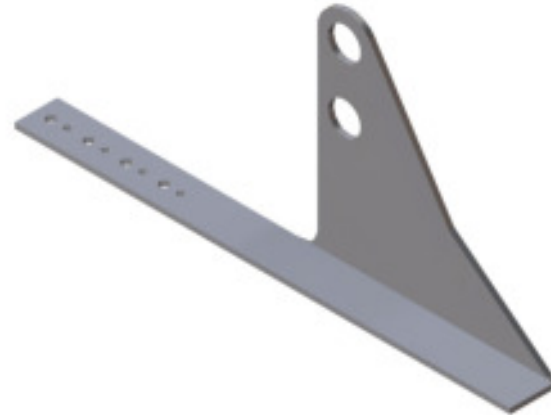
2 TUBE SNOW FENCE SYSTEM

NOTE: Due to specific job conditions, TRA Snow and Sun will only warranty a snow retention system/layout that has been designed by TRA Snow and Sun.